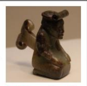
Jade figure found in the tomb of Fu Hao

The skeletons of six dogs and 16 humans were also found in the tomb. These were probably Fu Hao's pets and advisers, sacrificed to accompany her into the afterlife.